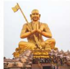
STATUE OF EQUALITY (SRI RAMANUJACHARYA SWAMY)