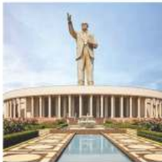
DR BABASAHEB AMBEDKAR STATUE