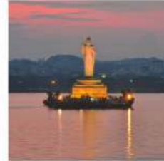
MUSICAL WATER FOUNTAIN AT HUSSAIN SAGAR