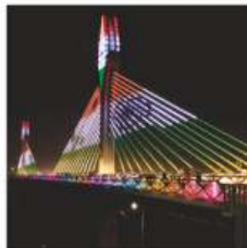
CABLE BRIDGE & DURGAM CHERUVU LAKE FRONT PARK