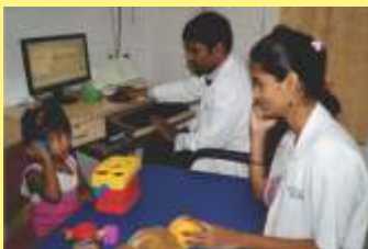
Cochlear Implant - Mapping

MRF helps hearing impaired by improving the quality of life through its Research, Prevention, Early detection, Education & Learning.