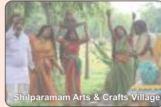
Shilparamam Arts & Crafts Village