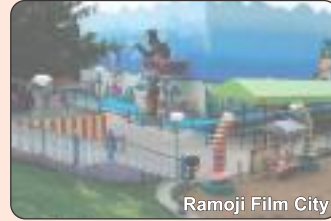
Ramoji Film City