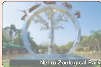
Nehru Zoological Park

Venue : The Park, Rajbhavan Road, Hyderabad