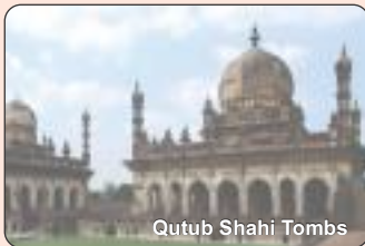
Qutub Shahi Tombs